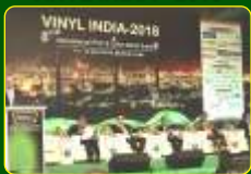
VINYL INDIA - 2018