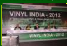
VINYL INDIA - 2012