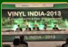
VINYL INDIA - 2013