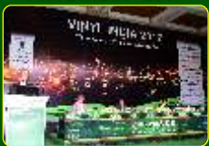
VINYL INDIA - 2017