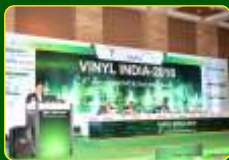
VINYL INDIA - 2016