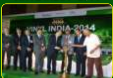
VINYL INDIA - 2014