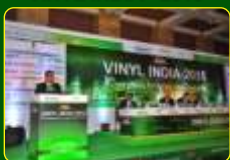
VINYL INDIA - 2015